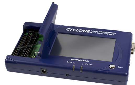
Cyclone LC programmer

The USB Multilink Universal and Universal FX are intended for development and are not designed to accommodate the demands of production programming. However, PEmicro's Cyclone LC and Cyclone FX programmers are specifically engineered to withstand the rigors of a production environment and will provide a seamless transition from the Multilink. In addition, the Cyclone FX offers an expanded feature set which includes faster communications, larger storage, expandable storage, enhanced security including SAP image encryption and programming restrictions, and expansion ports. More information is available online at: pemicro.com/cyclone.