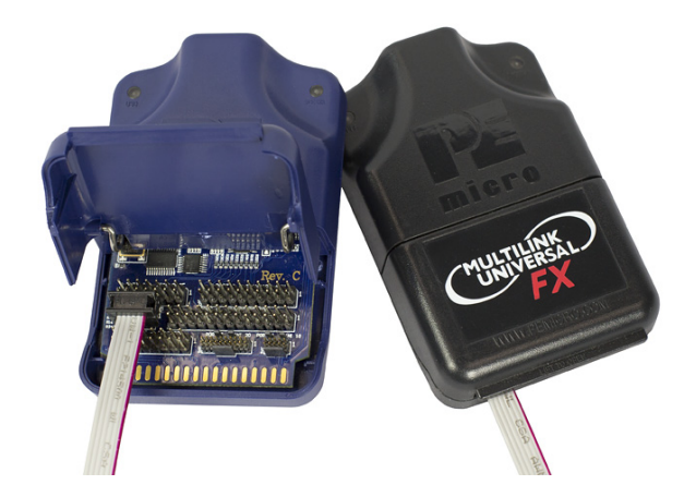
USB Multilink Universal & USB Multilink Universal FX